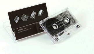
Cassette Tape - self promo item Amelie Au